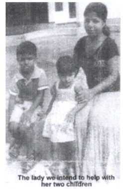
The lady we intend to help with her two children